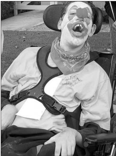
The residents got into the spirit of the day.