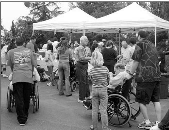
There was always a line at the Kiwanis food booth.