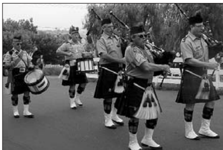
Bagpipers lead the parade.