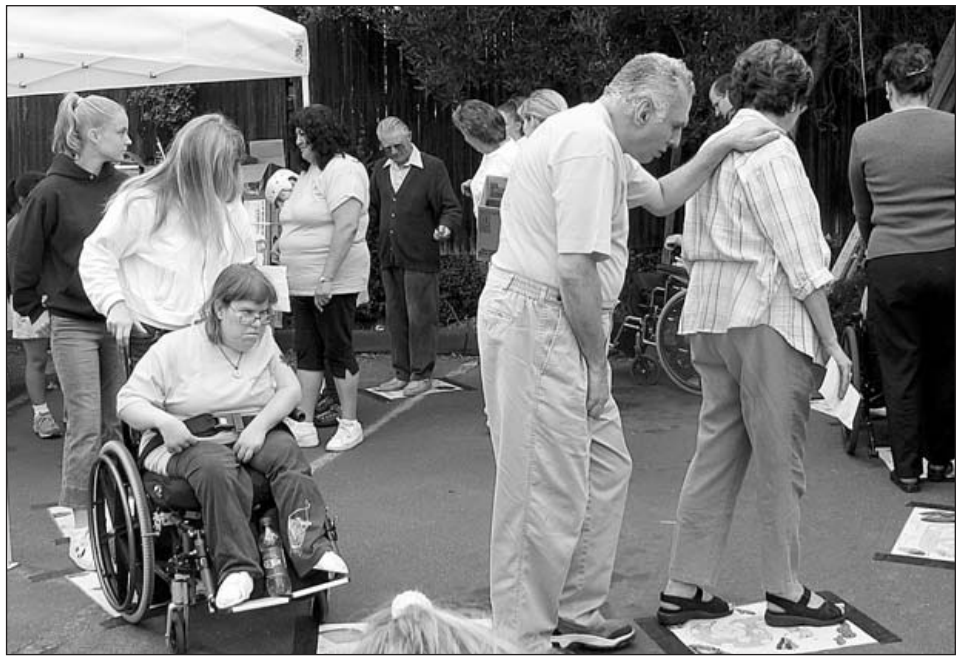
The "Cake Walk" was very popular, attracting lots of attendees.